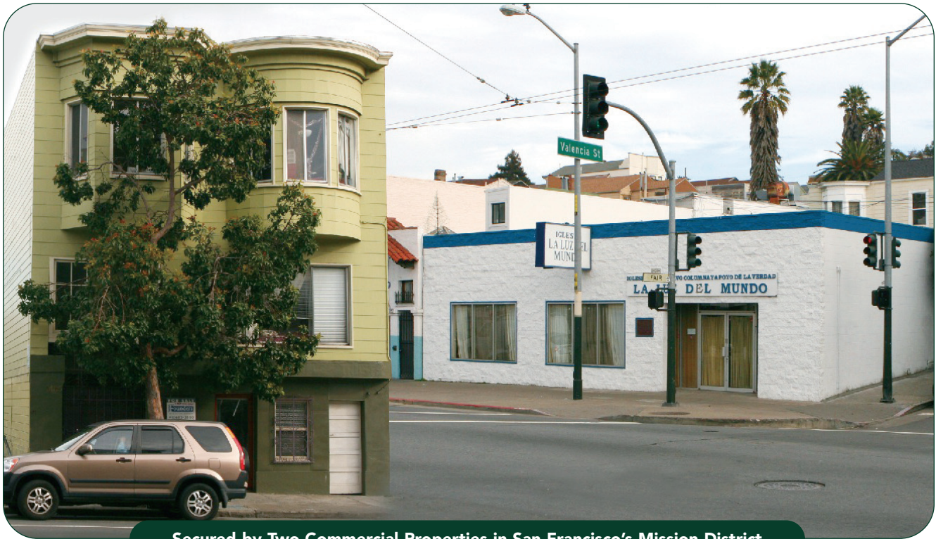
Secured by Two Commercial Properties in San Francisco's Mission District